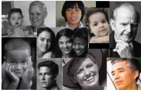
Copyright 2002 Riverdeep Interactive Learning Limited and its licensors. All rights reserved.

“E ven when I am old and gray, do not forsake me, O God, till I declare your power to the next generation.